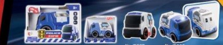
4" LIGHT & SOUND FRICTION TRUCKS