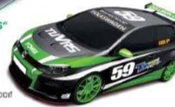
Volkswagen Golf GTI Clubsport ITEM NO. 94180