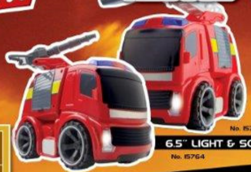
6.5" LIGHT & SOUND FRICTION TRUCKS No. 15764