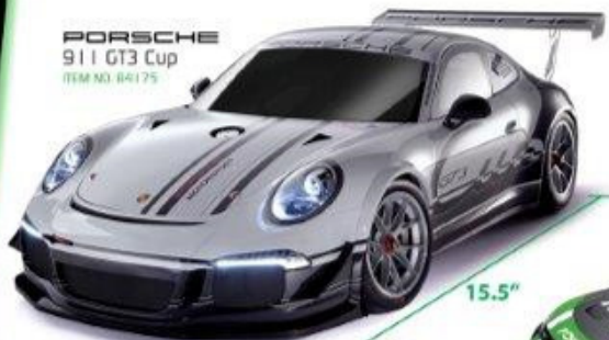
PORSCHE 911 GT3 Cup ITEM NO. 84175