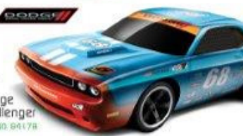
Dodge Challenger ITEM NO. 94178