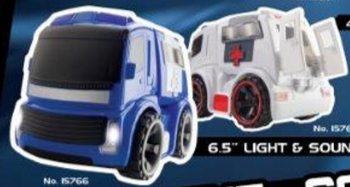
6.5" LIGHT & SOUND FRICTION TRUCKS