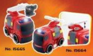
4" LIGHT & SOUND FRICTION TRUCKS